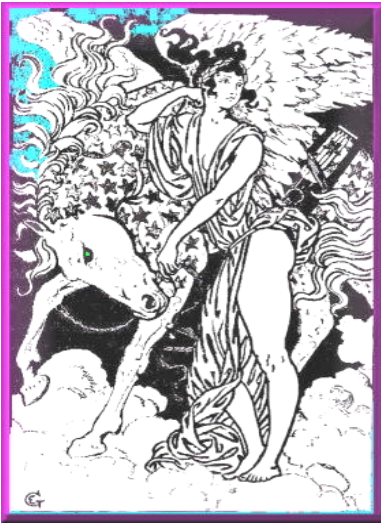
Eos, Goddess of Dawn; With Pegasus, her mount. Symbolizing Dawn of New Age Coming...