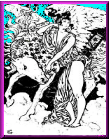
Eos, Goddess of Dawn; With Pegasus, her mount. Symbolizing Dawn of New Age Coming...

May 21, 2009 Thursday at 7pm Wisdom Quest Community Yellow Springs, Ohio