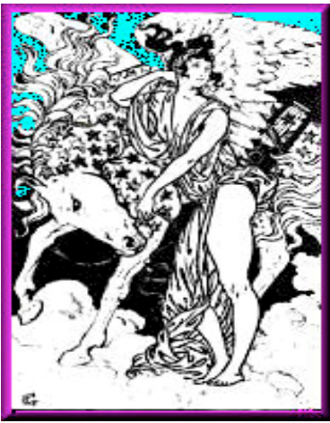
Eos, Goddess of Dawn; With Pegasus, her mount. Symbolizing Dawn of New Age Coming...