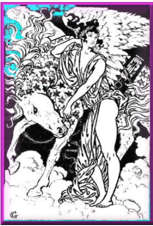
Eos, Goddess of Dawn; With Pegasus, her mount. Symbolizing Dawn of New Age Coming...